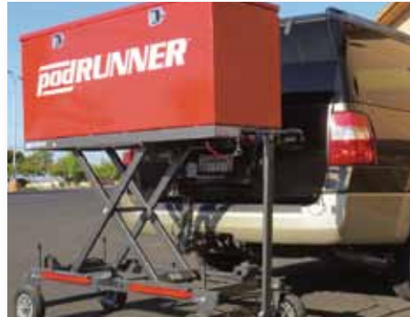
Scissor lift chassis enables one person to easily mount the PodRunner™ on any 2" trailer hitch without lifting.