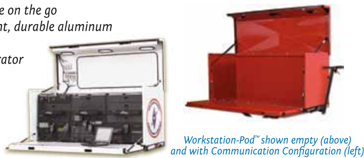
Workstation-Pod™ shown empty (above) and with Communication Configuration (left)