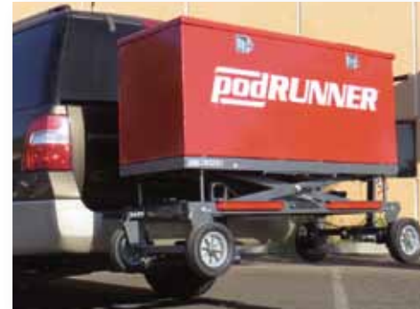
Wheels are suspended off the ground during transport, so there are no speed restrictions or licensing fees.