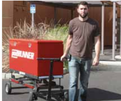
All PodRunners™ are easy to roll and are narrow enough to fit through doorways, making them versatile both indoors and out.