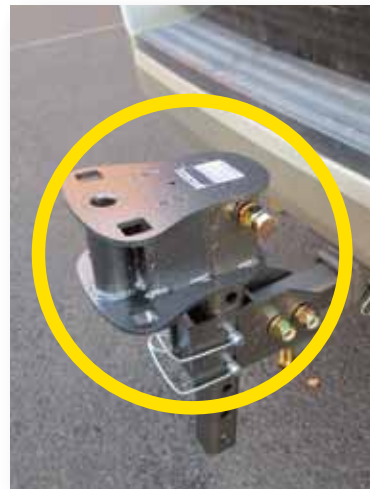
Universal hitch adapter works with standard 2" trailer hitch. No vehicle modifications required.